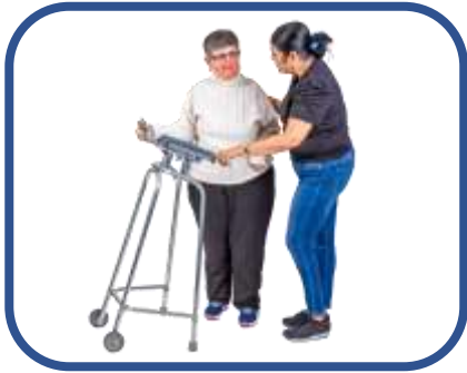
Mobility / physical impairment