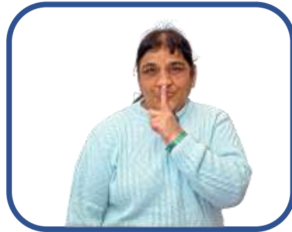
Prefer not to say