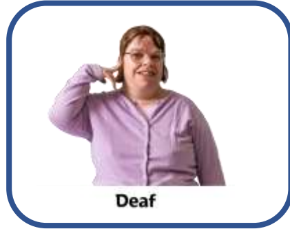
Deaf or hard of hearing