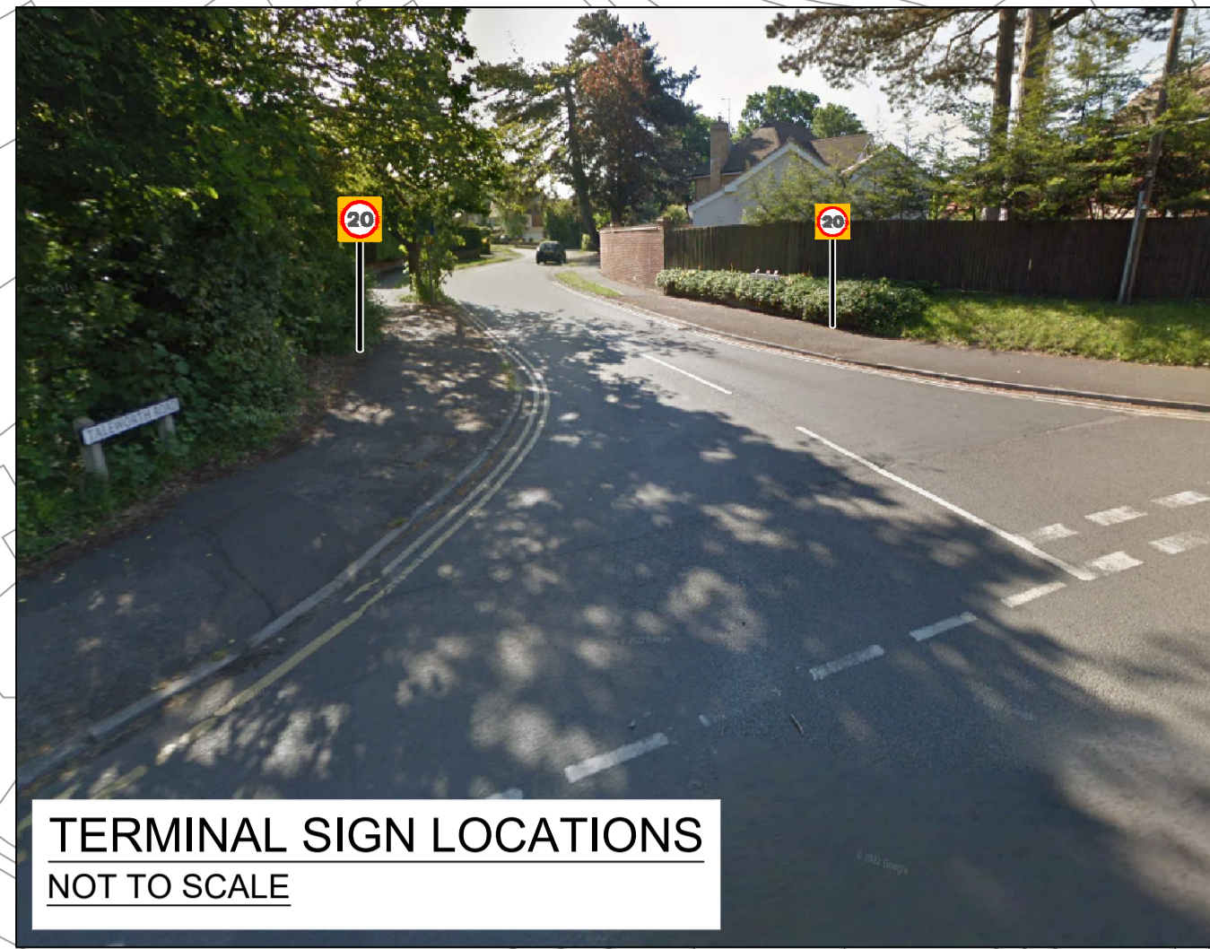
TERMINAL SIGN LOCATIONS NOT TO SCALE