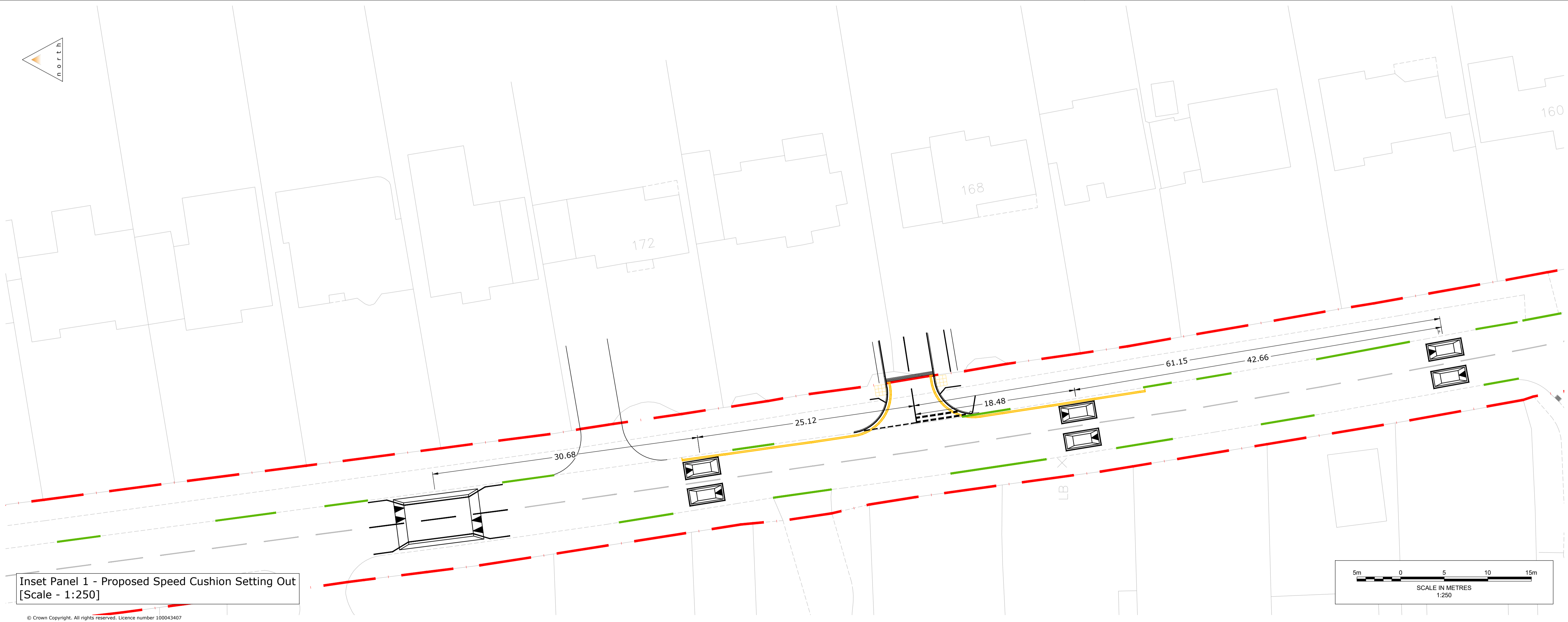
Inset Panel 1 - Proposed Speed Cushion Setting Out [Scale - 1:250]