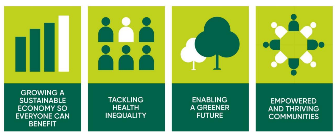
Our 4 priority objectives as an organisation. Growing a sustainable economy so everyone can benefit; Tackling health inequality; Enabling a greener future; and Empowered and thriving communities

Our Organisation Strategy 2023 to 2028 sets out how we intend to deliver on our mission through our 4 priority objectives. These are central to how we allocate our budget as we deliver high-quality and sustainable services for all.